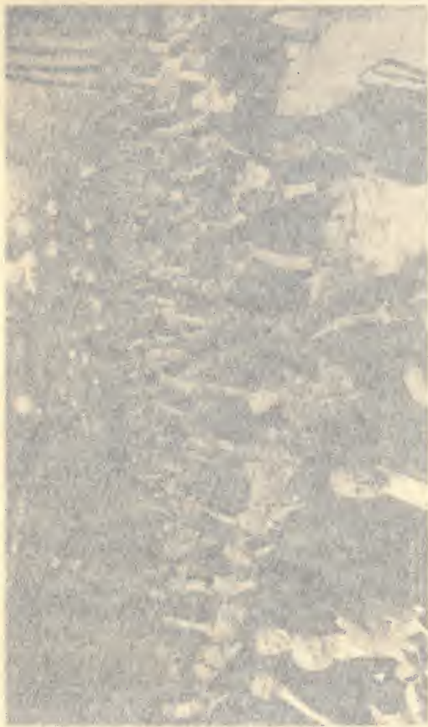
Yule Tide Feast, 1911